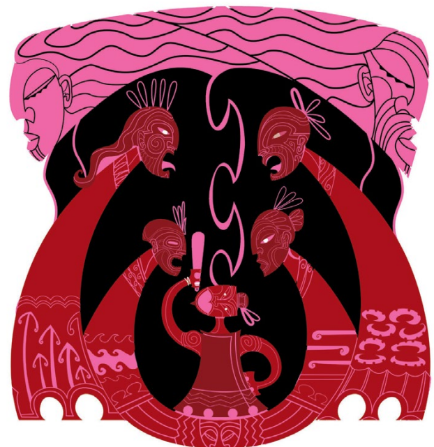
Figure 2: Central 'political' image by Ariki Arts depicts the origins of whaikōrero (speech making or debate), which is one of the core political structures in te ao Māori.

A further aspect to being culturally accountable, was to have the Aotearoa New Zealand guide translated into te reo Māori to support language revitalisation and treaty relationships. The translation is about the concepts and not literal meanings.