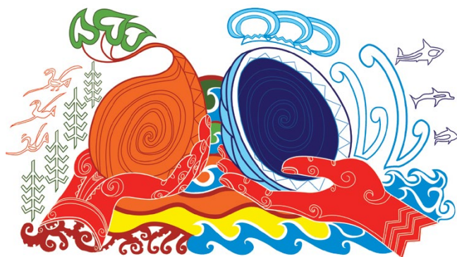
Figure 3: Central ‘financial’ image by Ariki Arts depicts resources traded between land and sea and the older means of exchange before the introduction of currency.