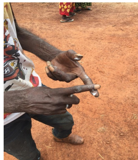
ARPNET PAR WORKSHOP