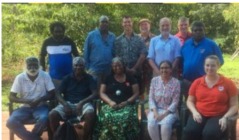
NAILSMA/ARPNET PARTNERSHIPS PROJECT MEETING PARTICIPANTS

Exchange ideas with other providers such as Red Cross – who have an international footprint and experience in this space.