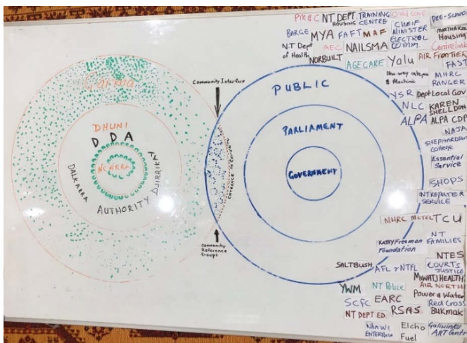
DIAGRAM SHOWING DDA STRATEGY FOR IMPROVED ENGAGEMENT WITH GOVERNMENT AGENCIES

Whilst several traditional-style authority structures exist at Galiwin'ku, these and the myriad of smaller reference or advisory groups set up to assist service providers are not independent of non-Indigenous service delivery agendas and are disconnected from each other. Through unveiling and highlighting issues around surrogate authority, the leadership group resolved to (re)create an independent and credible voice for Yolngu authority. They began a re-empowerment process and formed a formal group holding traditional authority, called the Dalkarra and Djirrikay Authority (DDA) from the unmasking and empowering effects of the research their kin had begun. The DDA then seeks a measure of order in agency engagement by creating an interface with the community in which agencies and their relevant Reference Groups engage. These Reference Groups are connected back to, informed by and provide information to Yolngu clan leaders (the DDA). In this model, tools for good cross-cultural communication and operation, protocols for engagement and mutual understanding about service delivery and outcomes can be reached.