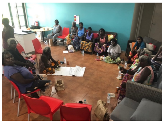
DALKARRA DJIRRIKAY GROUP MEETING