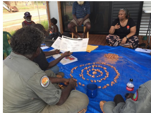
ARNPET PAR WORKSHOP