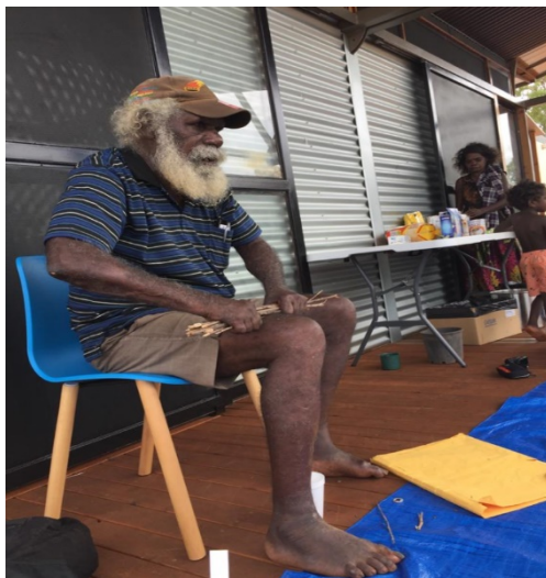
ARPNET PAR WORKSHOP

This can be overwhelming if that leader is not supported. The ladder is being used to discuss the relationship that leaders have with the community and other leaders. We are talking about how some members of the community get left behind, and how some leaders get overwhelmed as they climb higher on the ladder.