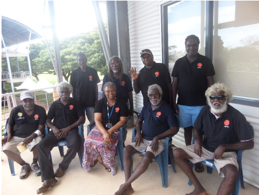
ELDERS FROM CENTRAL AND WEST ARNHAM INVOLVED IN THE ARPNET LED PROJECT

organized firstly around bapurru or clan groups. There are well developed protocols for decision making in communities that should be recognized. For example, individual family and clan leaders have people and areas they are responsible for and must work with others to address community wide or landscape scale concerns. It is important to understand this and seek to empower this system and its representatives to get more effective participation and decision-making for emergency response.