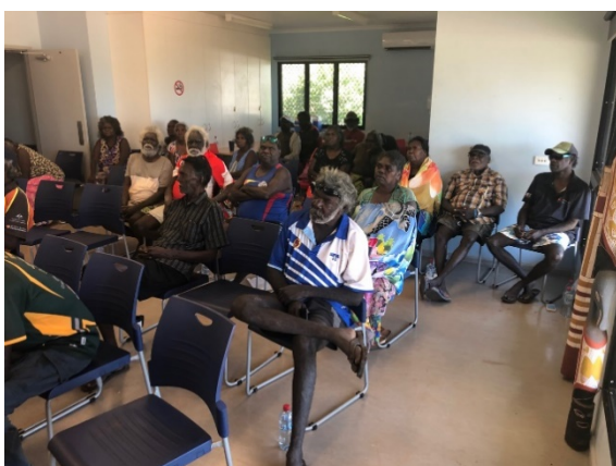
DALKARRA DJIRRIKAY GROUP MEETING

In Galiwin'ku, of the critical findings, poor communication between service providers and community residents became the main focus of community leaders. They determined that this is a strong contributing factor in Yolngu