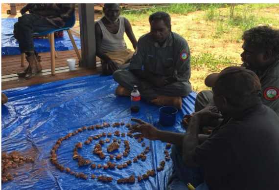
ARNPET PARTICIPATORY WORKSHOPS

In these photos we are using diagramming to talk about community and the different agencies that come to work in the community. Picture 1 which is a pile of rocks was used to talk about the community – how the people and agencies see it. Clear that within the pile there are distinct divisions that are made resulting in not one but many communities. Unpacking what these sub-groups are is important for local leaders and for outside agencies if they want to be inclusive.