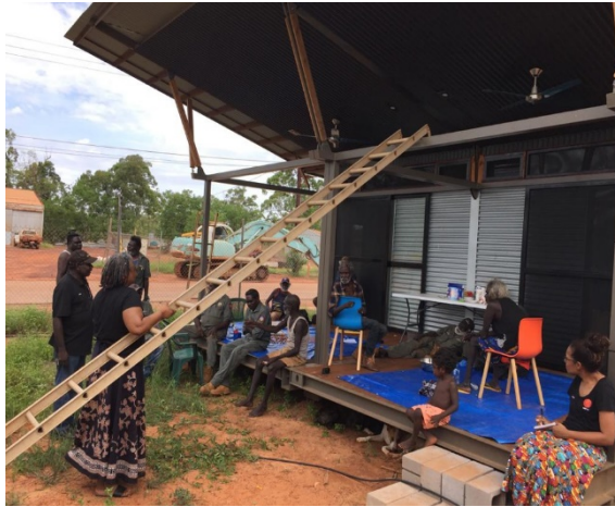
ARPNET PAR WORKSHOP