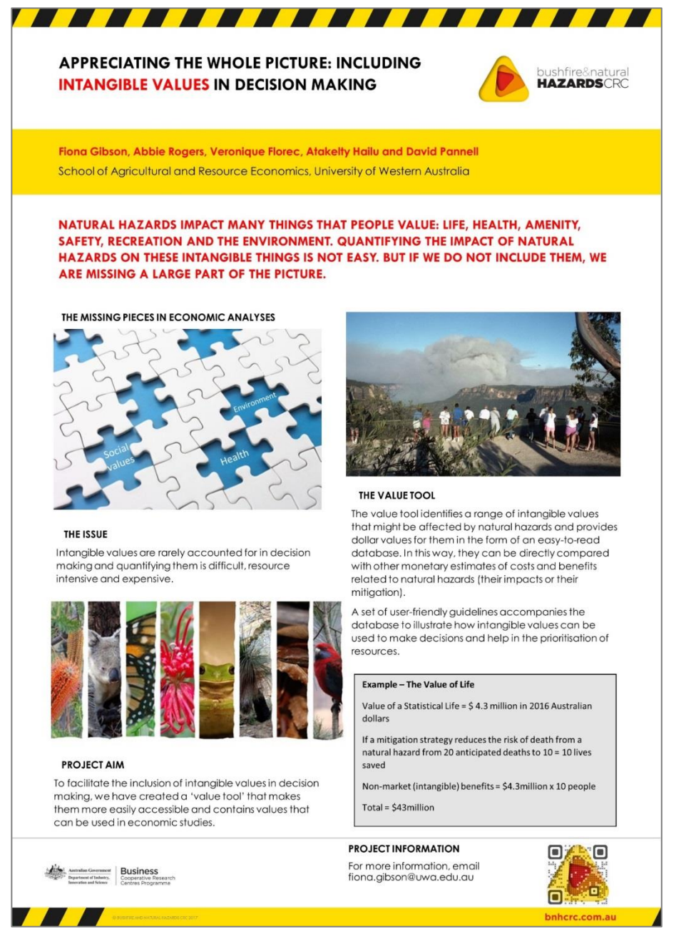
Figure 2. Value Tool poster for AFAC 2017

A poster showcasing the Value Tool Database and why it is important to include intangible values in decision making was presented at the 2017 AFAC/BNHCRC Conference (see Figure 2).