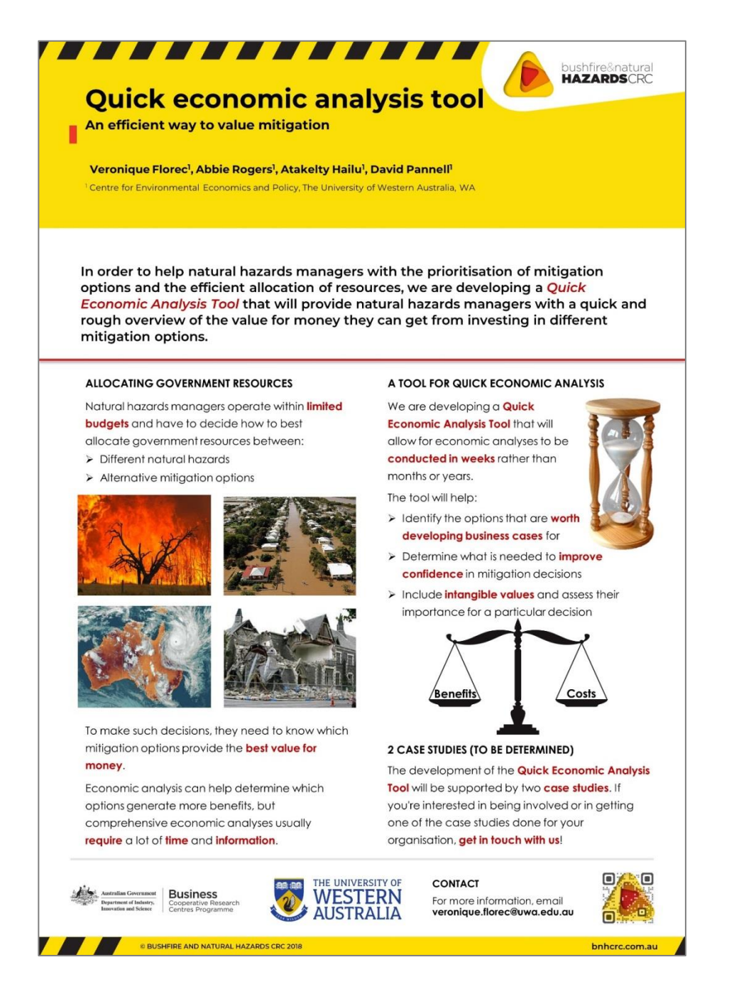
Figure 3. Quick Economic Analysis Tool poster for AFAC 2018

A poster showcasing the Quick Economic Analysis Tool and what it is intended to achieve will be presented at the 2018 AFAC/BNHCRC Conference (see Figure 3).