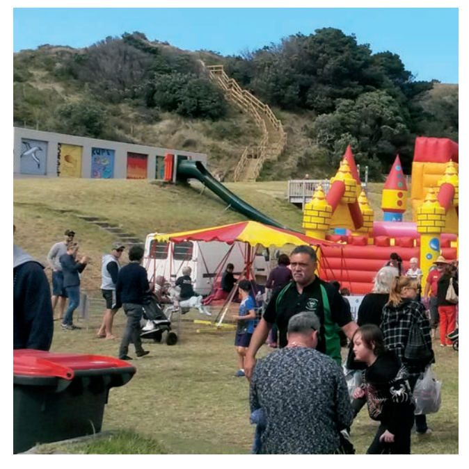
Tsunami steps at Seatoun School, Wellington (seen in the background) were funded by a community fund-raising event (shown in the photo) on 13 March 2016 and from local council.

Although comprising a sample of only 17 schools, the present exploratory study serves as a starting point for understanding some aspects of school preparedness for tsunami, and informs some future research requirements.