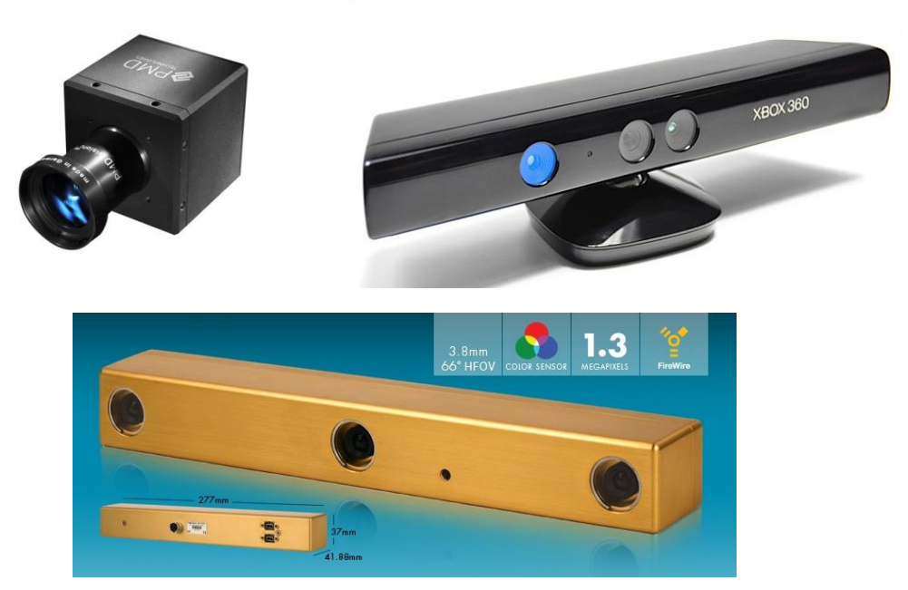
FIGURE 4 – EXAMPLES OF A) TOF (PMD CAMCUBE), B) STRUCTURED LIGHT (MICROSOFT KINECT) AND C) STEREO (POINTGREY BUMBLEBEE X3) CAMERA TECHNOLOGY.

work on slightly varying principles, however, produce similar raw data products allowing them to be grouped into a single emerging technology.