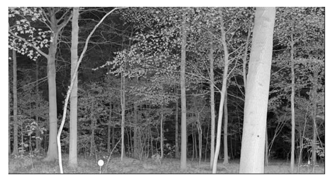
FIGURE 1 - AN EXAMPLE OF A TLS POINT CLOUD.

The operating principles of TLS enable the collection of highly detailed and accurate 3D point clouds, from which information describing the surrounding environment can be extracted (Figure 1). Laser scanning (including terrestrial, airborne and mobile (discussed below)) has the ability to penetrate through loosely arranged elements (i.e. of vegetation) and provide information on partly occluded objects. This penetration occurs due to the use of an active light source and the ability to acquire multiple reflections per emitted pulse. Collecting raw data representing the vegetation structure, as well as the underlying terrain, allows quantifiable estimates of vegetation height and biomass to be extracted from a single scan [2].