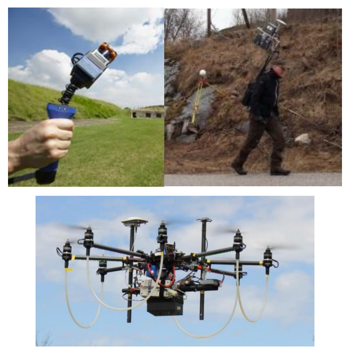
FIGURE 2 – THE ZEB1 LASER SCANNER, THE BACK PACK SCANNER USED IN LIANG ET AL. (2014) AND THE UAV LASER SCANNER DESCRIBED IN WALLACE ET AL. (2012)

TLS is often refers to the collection of data usually with a static laser scanner placed in single or multiple locations. Mobile Laser Scanning (MLS) follow the same basic principles as TLS, however, make use of a dynamic platform to capture a wider area more rapidly. MLS data has been collected from personal (hand-held/backpack) devices [10], [11], light weight ground vehicles such as quad bikes [12] and Unmanned Aerial Vehicles [13]. As MLS systems are dynamic, measurement requires knowledge of the relative position and orientation of the scanner to locate objects within the scene. In comparison to TLS, this introduces further sources of uncertainty into the laser scanning system and decreases the registration accuracy of the produced point clouds.