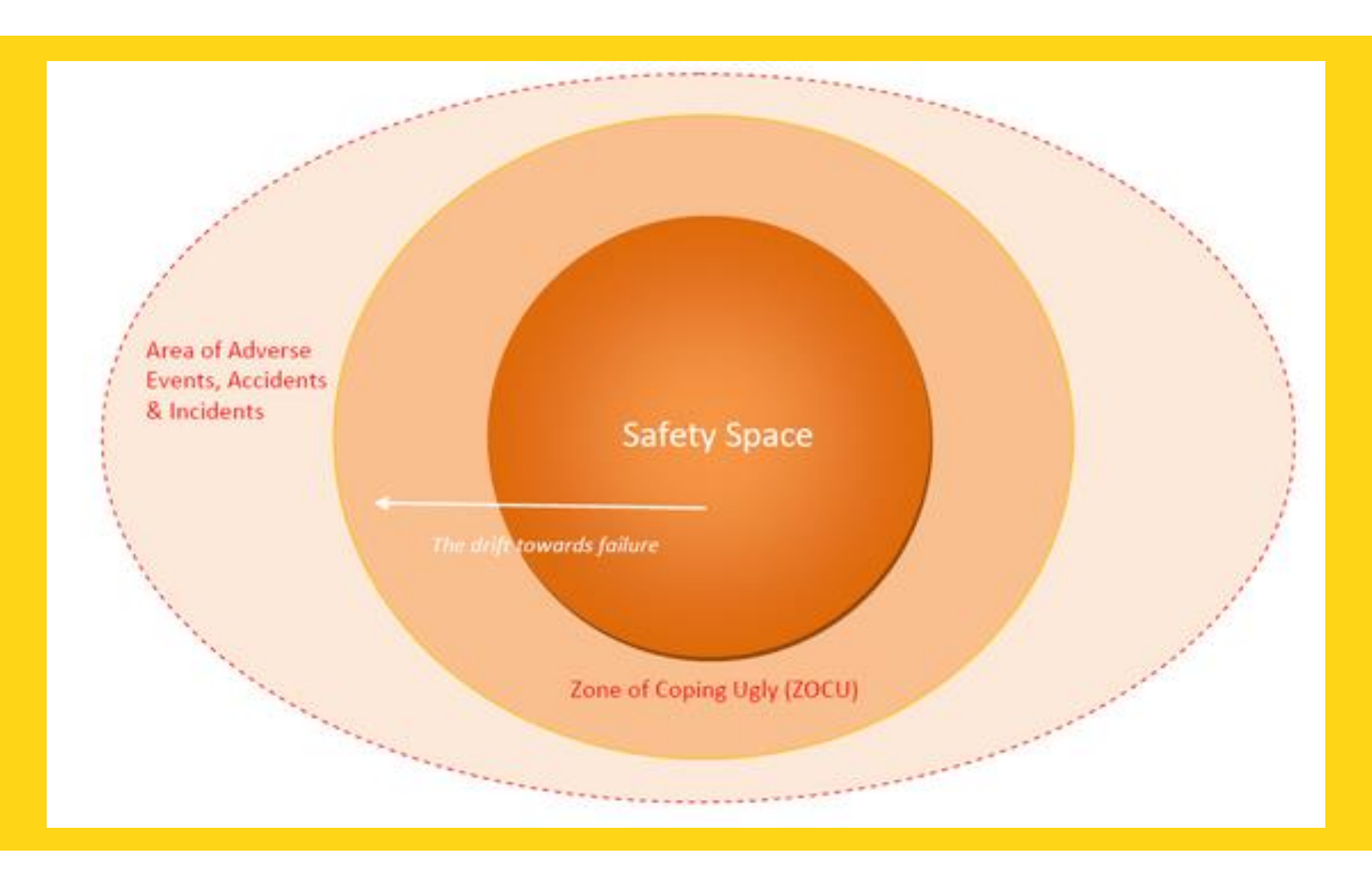
From Brooks (2014)