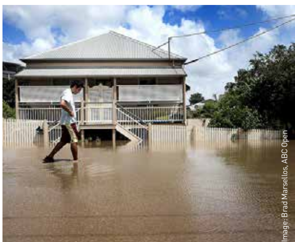
A resident walks through flood waters in the suburbs of Brisbane in 2011.

Also at this time, there were 72 organisations registered to receive volunteers (Table 1). They have provided over 128 discrete volunteering opportunities and received more than 32 000 volunteers through EV CREW (bearing in mind that a large majority were referred for Brisbane flood clean-up in 2011). Over half of the registered organisations are not-for-profit organisations, such as Australian Red Cross, Habitat for Humanity and Conservation Volunteers Australia. Smaller community groups registered with EV CREW include sporting clubs, community and relief centres, and neighbourhood houses.