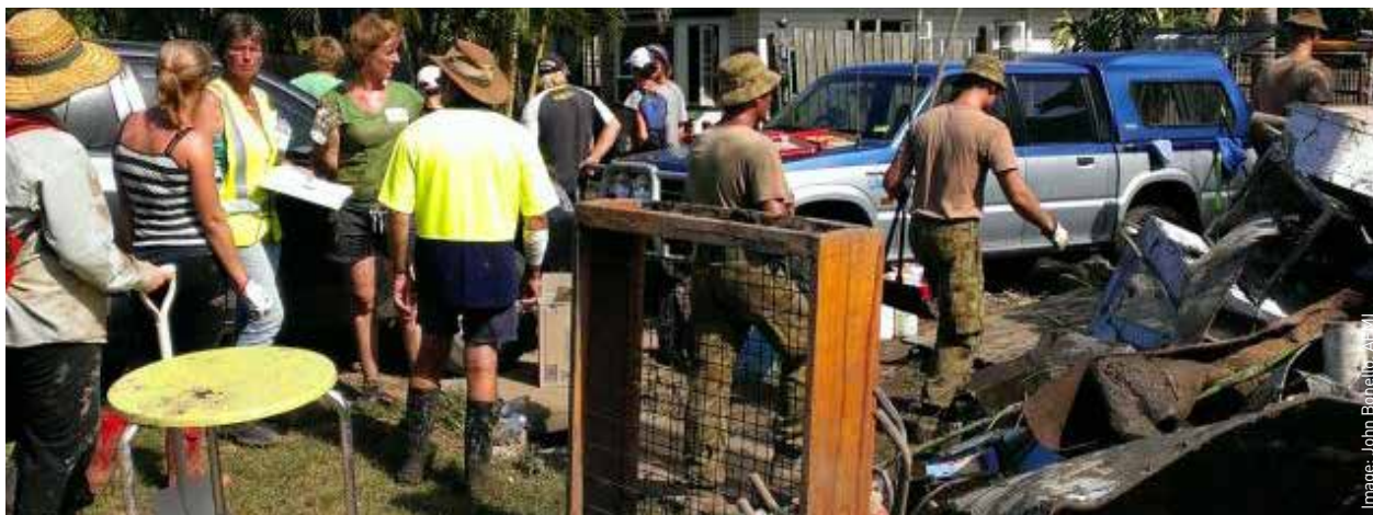
The clean-up at Bundaberg with help from the 'Mud Army' following Cyclone Oswald.