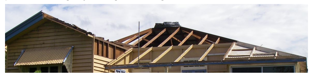
FIGURE 1. REMOVAL OF ROOF CLADDING AND BATTENS FROM WINDWARD FACE

Damage investigations of housing, conducted by the Cyclone Testing Station (CTS) in the Northern Territory, Queensland, and Western Australia, from cyclones over the past fifteen years have shown that the majority of houses designed and constructed to current building regulations have performed well structurally by resisting wind loads and remaining intact [1, 5, 7, 8, 12]. However, these reports also detail failures of contemporary construction at wind speeds below design requirements. The poor performance of these structures (Figures 1 and 2) resulted from design and construction failings or from degradation of construction elements (i.e. corroded screws, nails and straps, and decayed or insect-attacked timber). Hence, the development of retrofit solutions for structural vulnerabilities are critical to the performance longevity of all ages of housing.