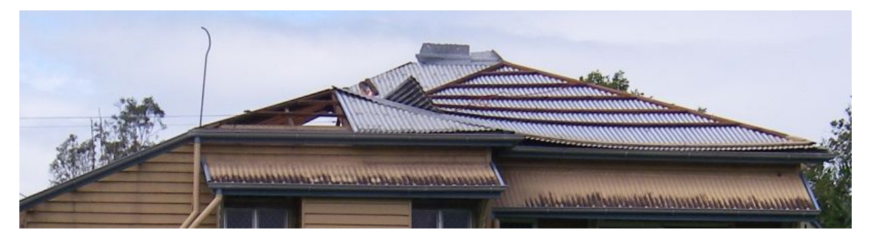
FIGURE 2. PART OF THE ROOF CLADDING WITH BATTENS STILL ATTACHED FLIPPED ON TO LEEWARD SIDE