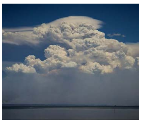
Fig 2. The fire plume and pyrocumulonimbus cloud with a cap of pileus cloud, indicating rapid vertical growth and high instability.

Pyro-convection developed late in the morning against normal diurnal trends.