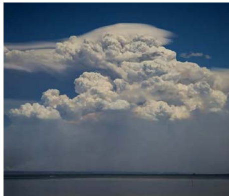
Fig 2. The fire plume and pyrocumulonimbus cloud with a cap of pileus cloud, indicating rapid vertical growth and high instability.

Pyro-convection developed late in the morning against normal diurnal trends.