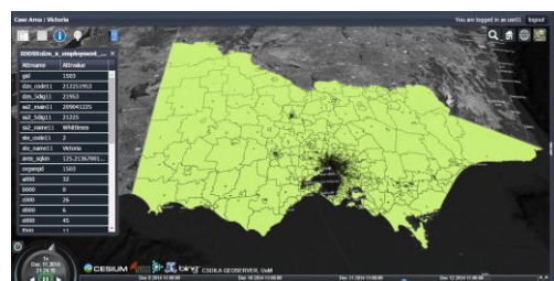
Figure 1: Delineating destination zones in Places-of-Work (POWP) data 2011

Second, for disaggregating these sector-wise GSP to a smaller geographic level, the total number of employment in each sector at a finer spatial unit—Destination zones (DZNs) — taken from the Places of Work database (POWP, 2011) is used. This historical series of natural disaster events are sourced from the Australian Emergency Management Knowledge Hub (AEM, 2014) that provides data on the location of incidence and its intensity in terms of human mortality and casualties. Finally, to identify the exogenous sources of natural disasters, we collected time-series gridded data on various climatic features such as monthly rainfall, temperature, and wind speed from the Bureau of Meteorology, Australia (BOM, 2015).