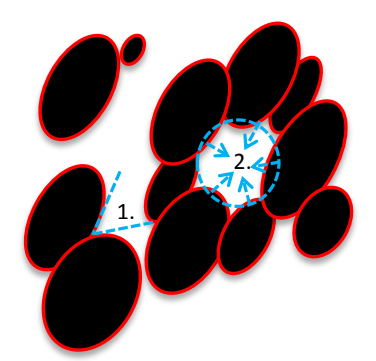
Figure 1: Schematic representation of coalescing spot fires. Fire line merging is taking place at point 1, while perimeter collapse is taking place at point 2.

In each of the two cases depicted in Figure 1 the fire can exhibit abrupt increases in rate of spread – these arise as a consequence of dynamic fire-fire and fire-atmosphere interactions.