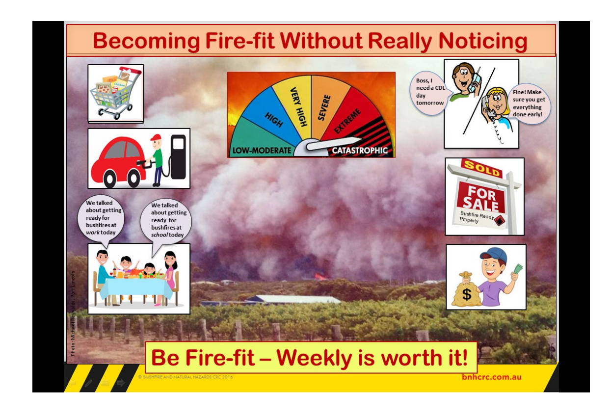
Figure 2: A new type of workplace leave, financial incentives and synchronicity in the social microclimate are some fire-fitness strategies to normalise preparedness.