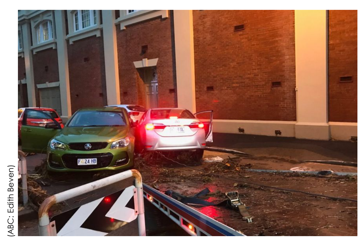
Figure 1: In May 2018 residents awoke to cars floating down the street in Hobart due to flash flooding on the Hobart Rivulet. Insurance claims in the region totalled close to $100 million<sup>1</sup>.