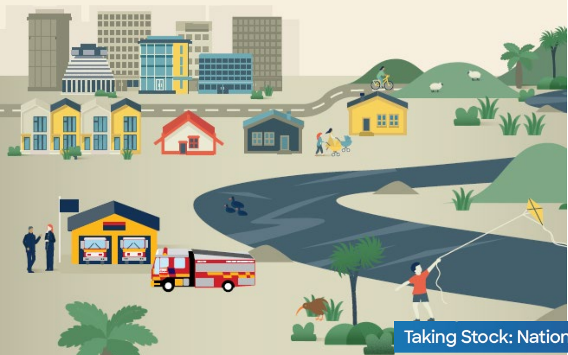
Taking Stock: National Workplace Culture Hui