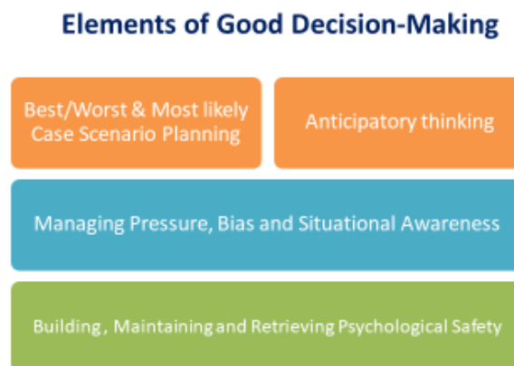
FIGURE 2: STRUCTURE OF THE TRAINING COURSE IN DECISION-MAKING

The key modules within the course are identified in the figure below.