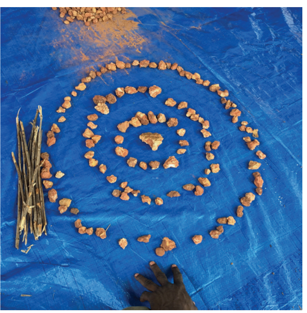
Some Yolngu explain their family / land relationships

Skin relationships have a set of prescribed rules about responsibility, trust, formality (or not) and proximity. These rules are embedded into every day life. They lead to behaviors that may seem unusual to non-Aboriginal people.