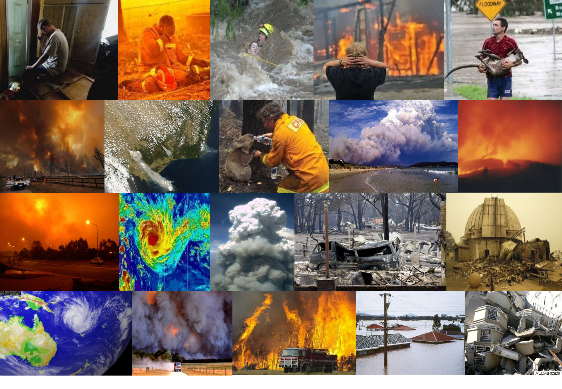
"Nature, in order to be commanded, must be obeyed" – Sir Francis Bacon