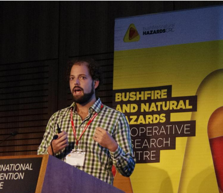
Nine more PhD's complete EMERGENCY MANAGEMENT, MULTI-HAZARD