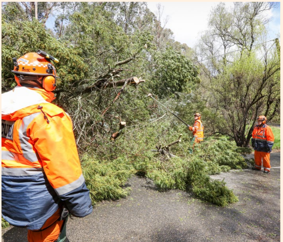
▲ Above: EMERGENCY SERVICE VOLUNTEERS ARE CRUCIAL TO ENSURING THEIR LOCAL AREA CAN BOUNCE BACK AFTER AN EMERGENCY.

This research has developed an index of disaster resilience that is designed to help meet the challenges of Australia's natural hazards. For the first time, this index will assess and report the state of disaster resilience on a large scale across Australia. The index will use a nationally standardised measure that will make it easy for end-users to identify areas of strength and areas needing improvement, to plan future actions, policies and programs, and provide a baseline from which to measure progress in disaster resilience.