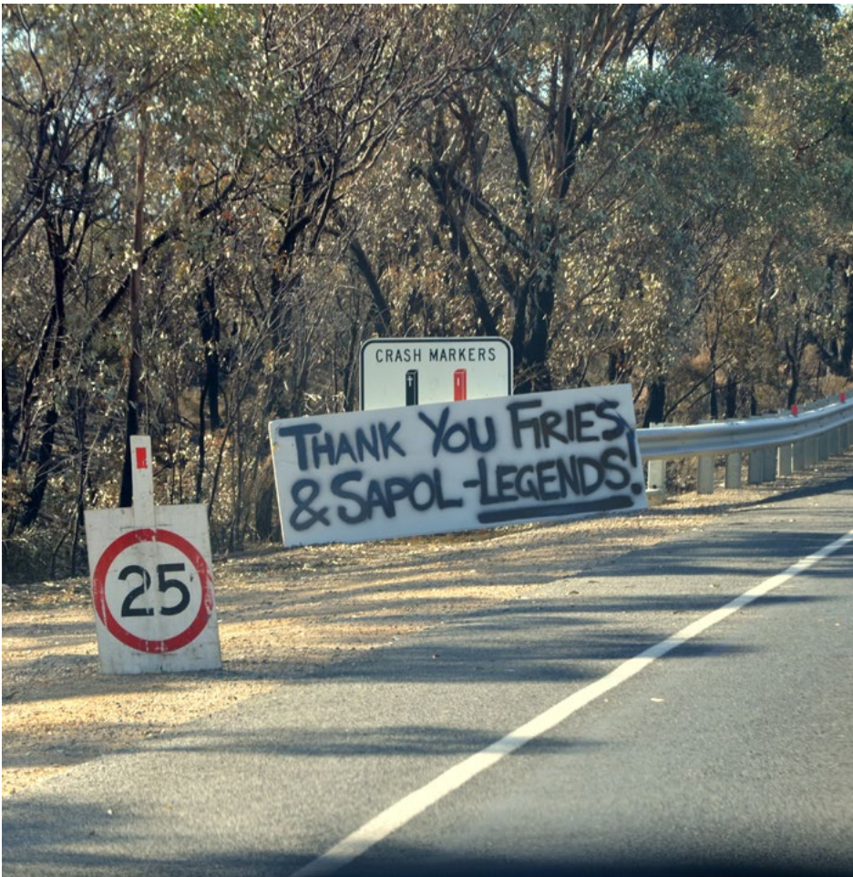
▲ Above: THIS PROJECT IS DEVELOPING A NATIONALLY STANDARDISED MEASUREMENT FOR RESILIENCE ACROSS AUSTRALIA.

will involve standardising the indicators, removing any correlated indicators and aggregating the indicators into an index.