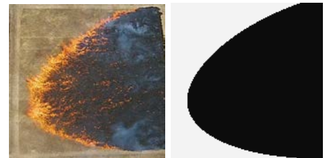
Figure 3: Aerial photograph of an experimental grassfire (left). Output from the curvature-based fire spread model (right).

Figure 2 shows the output of the curvature-based model compared with infrared imagery of a laboratory-scale fire. As can be seen, the model provides a good qualitative fit with the observational data. The quantitative agreement is also reasonably good, with the curvature-based model able to accurately reproduce the acceleration of the point of intersection of the two fire lines.