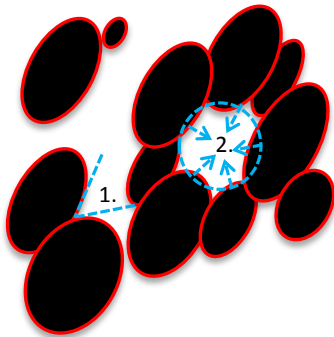
Figure 1: Schematic representation of coalescing spot fires. Fire line merging is taking place at point 1, while perimeter collapse is taking place at point 2.

In each of the two cases depicted in Figure 1 the fire can exhibit abrupt increases in rate of spread – these arise as a consequence of dynamic fire-fire and fire-atmosphere interactions.