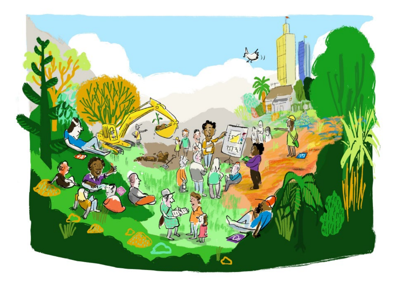
Figure 2: Cover image of the first resource produced through the ReCap project

<sup>1</sup>Flora, C., Flora, J., & Fey, S. (2004). Rural Communities: Legacy and Change (2<sup>nd</sup> ed.). Boulder, CO: Westview Press.